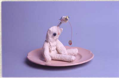
Depressed bear of the southeast no. 1 © Matt Rowe 2005