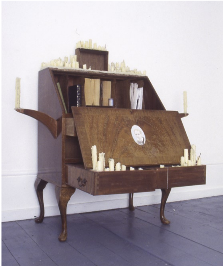
Bureau for Charles Baudelaire ©Joseph Burthe 2005

Combined with portraiture, the selected materials are given further historical narrative. Culturally significant figures are depicted in oil paint, applied directly to the reassembled domestic items. The biographical history of the chosen subject becomes associated with the particular historical narrative of the chosen materials.