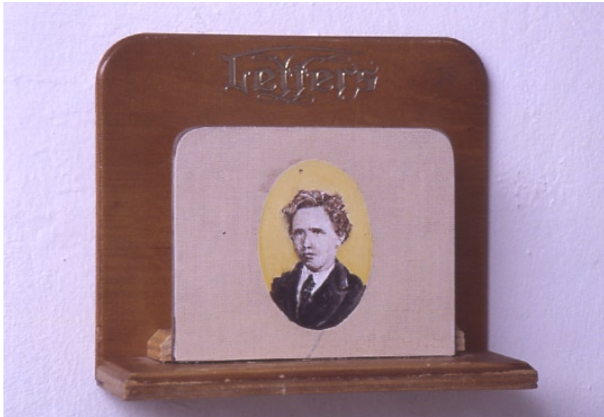
Letter Rack for Vincent Van Gogh ©Joseph Burthe 2005

The artist selects materials for use in the creative process that are representative of a particular social heritage and status, and as such will have particular connotations for the viewer. In this instance, furniture and other domestic items have been reconstructed, combined with other media and incorporated into the art object. Removed from their functional context, each domestic item suggests an individual historical narrative alluding to its background and previous owners.