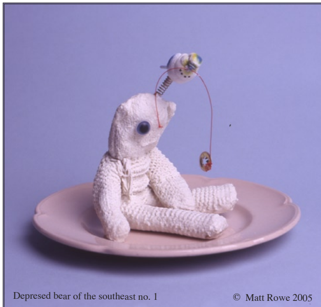
Depresed bear of the southeast no. 1