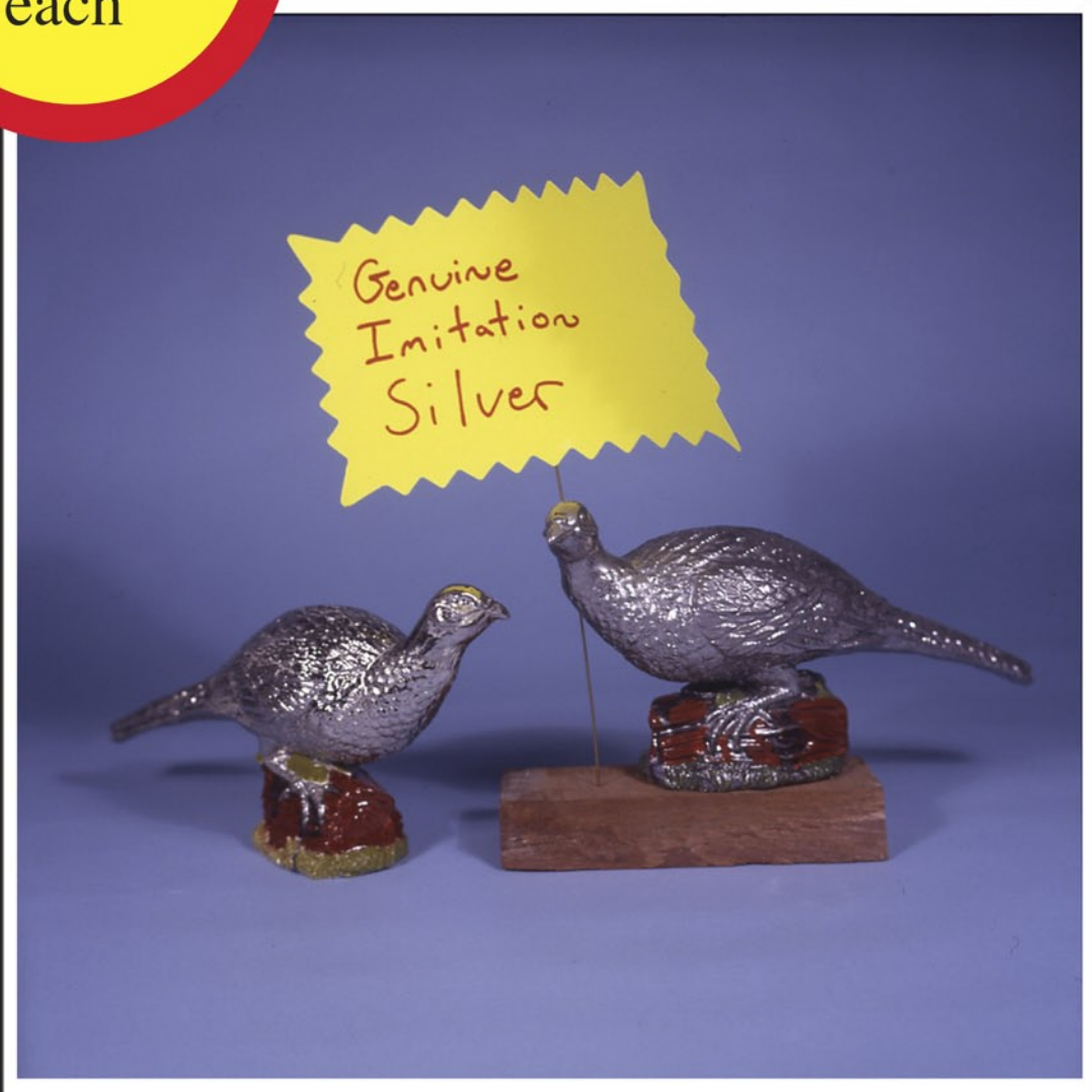
'Genuine imitation silver pheasants' 2004

The pieces investigate how British ceramic industry has traditionally imitated the more valuable and fashionable silver wear objects thought history.