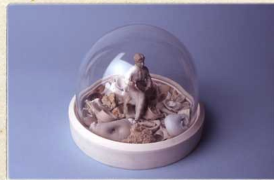
Cinque port spectator sport No.1