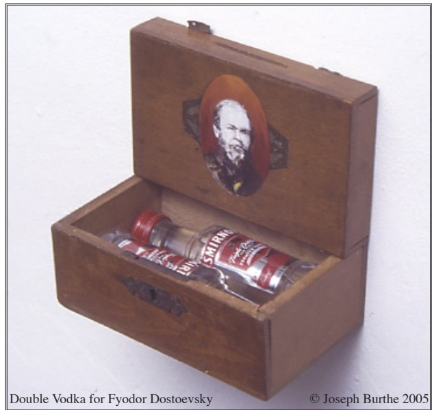
Double Vodka for Fyodor Dostoevsky