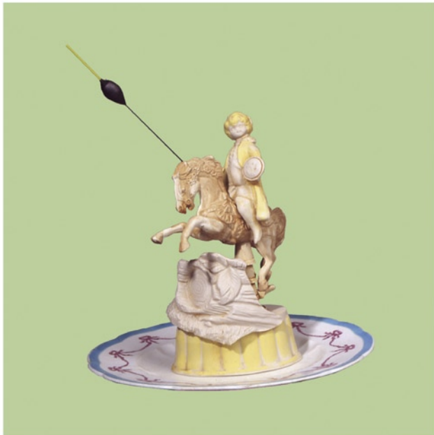
St. George for tea

Through the conscious and structured manipulation of decorative objects and the analysis of ceramic materials as part of visual culture the work becomes a hybrid of sources splicing together disparate forms in an attempt to create a new object. An amalgamation, indicative of the contemporary moment: a social indicator registering on both a personal and historical level.