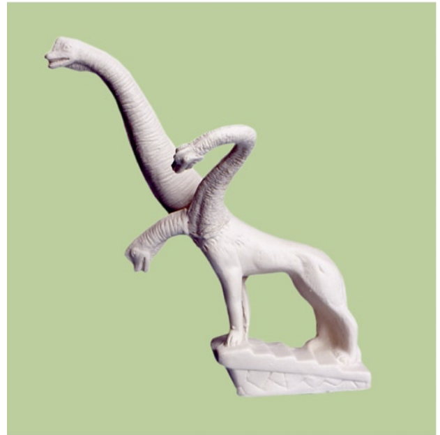
The Dragon © 2005 Matt Rowe